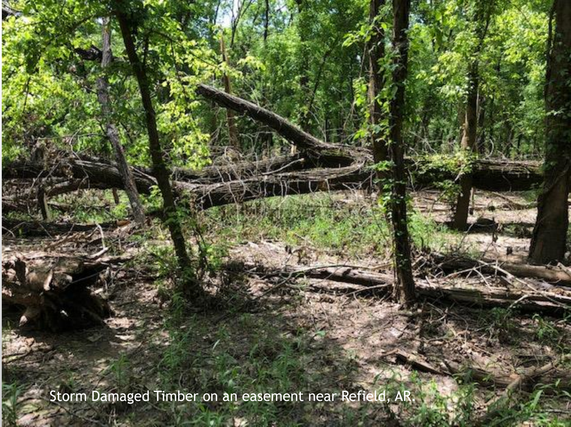
Storm Damaged Timber on an easement near Refield, AR.