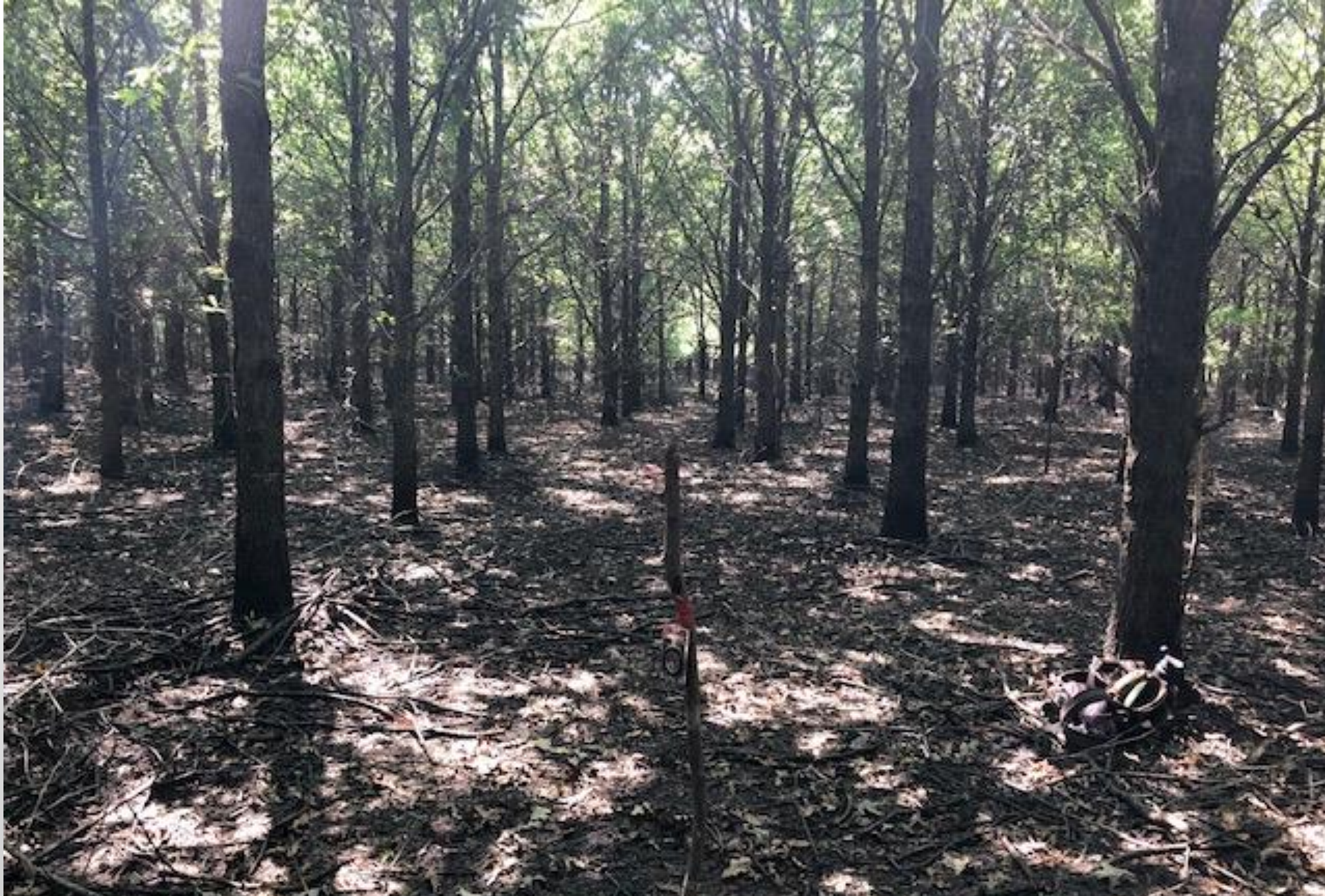
This is an example of a WRE planting where the planted trees have captured the site and converted it back to a hardwood timber cover.