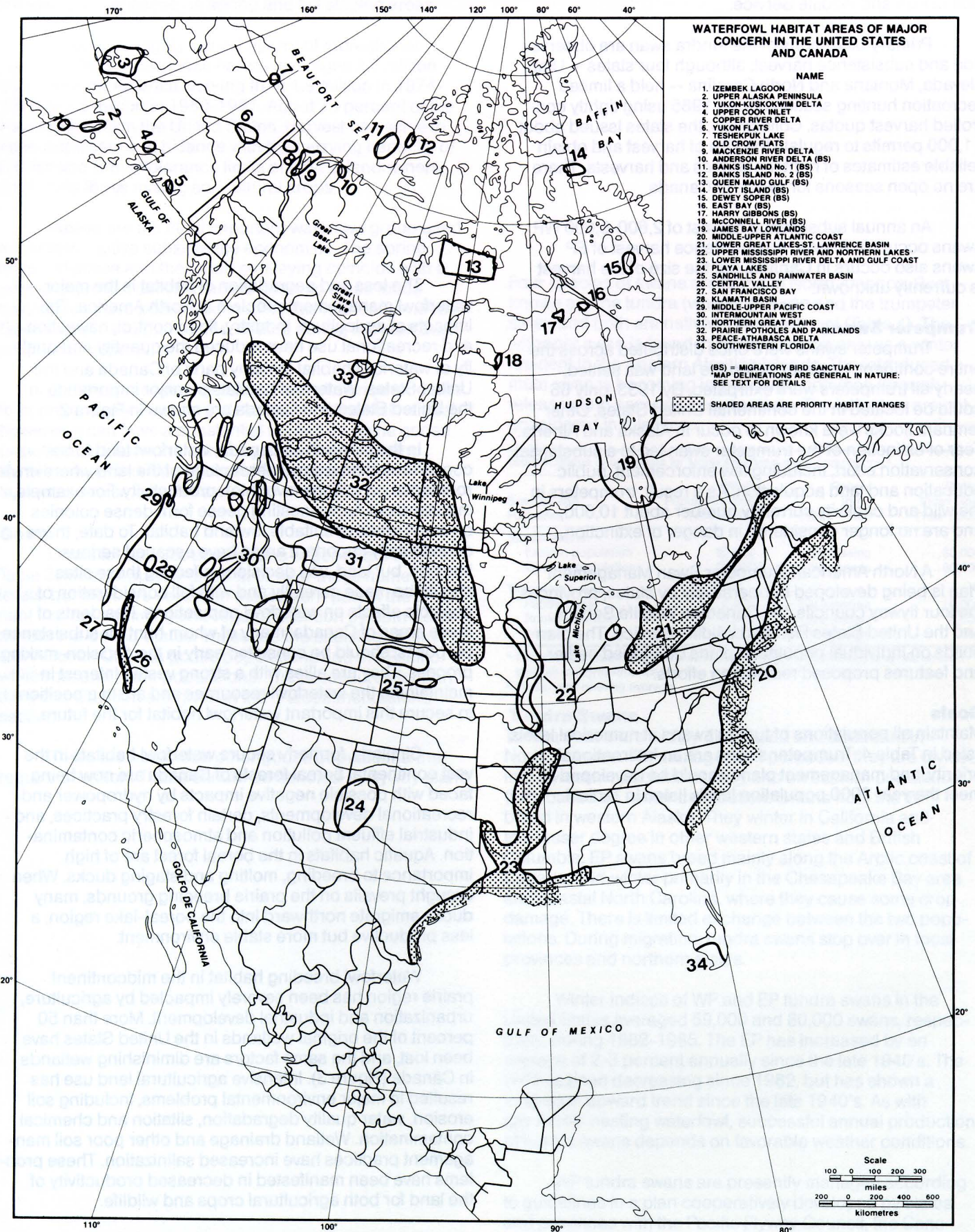
Figure 2. Waterfowl habitat areas of major concern in Canada and the U.S., 1985