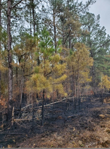
Prescribed burn completed using cost share assistance in the MFFI geography to reduce the risk of wildfire hazard.

LSU presented survey analyses to the MFFI partnership to include information on landowner demographics, property characteristics, conservation practices, certification, outreach, and more! Most landowners were 55-84 years old, owned 51 to 250 acres, and cited family legacy as an extremely important reason for owning their forest lands. The most desired form of information was through printed materials and onsite visits.