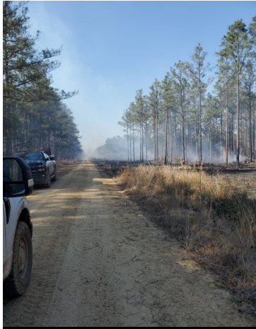
An existing road being used as a firebreak during a prescribed burn to limit the needs for putting in additional firebreaks.

The Open Pine Landscape Restoration Regional Conservation Partnership Program was announced in January by NRCS. This program provide cost share to specifically increase open forest conditions in north Louisiana and south Arkansas. For more information, see the attached fact sheet or visit https://www.lmvjv.org/ar-la-repp or the promotional video shared by This Week in Louisiana Agriculture here https://fb.watch/bbtLDcUBXp/ .