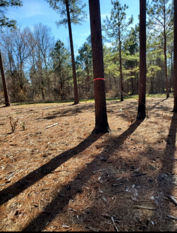
This open pine stand was treated using mechanical methods to reduce the dense midstory for better forest health and reducing competition.