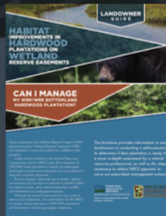
Habitat Improvements in Hardwood Plantations on Wetland Reserve Easements: Landowner Guide

https://www.lmvjv.org/s/wetlandmanagementhandbook.pdf