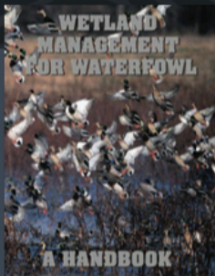
Wetland Management for Waterfowl: A Handbook