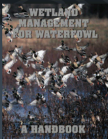
Wetland Management for Waterfowl: A Handbook