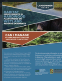
Habitat Improvements in Hardwood Plantations on Wetland Reserve Easements: Landowner Guide

https://www.lmvjv.org/s/wetlandmanagementhandbook.pdf